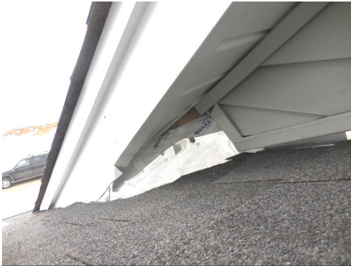
A very poor flashing detail was found on the roof over the front entry porch.