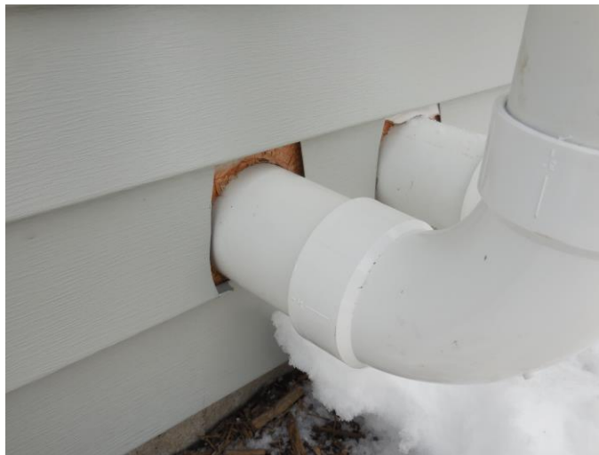
The siding around the furnace intake and exhaust needs to be replaced.

Seal the asphalt driveway every 2 to 3 years to prevent premature deterioration. Sealing every year may cause a buildup of sealant and actually start to peel.