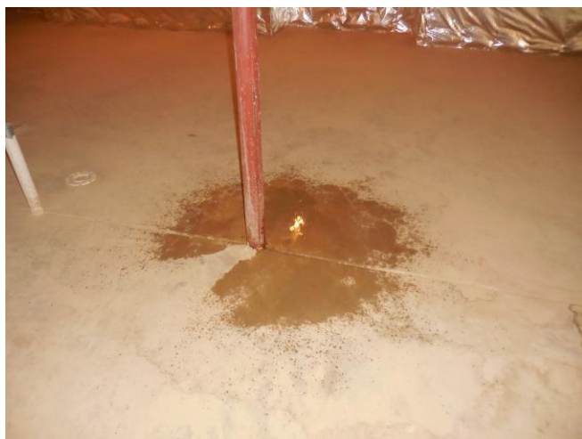
This is the result of the leak.

The average life expectancy of a water heater is 8 to 12 years . Signs of when a water heater is starting to fail are the loss of the hot water supply (hot showers tend to get shorter) and leakage around the base of the water heater.