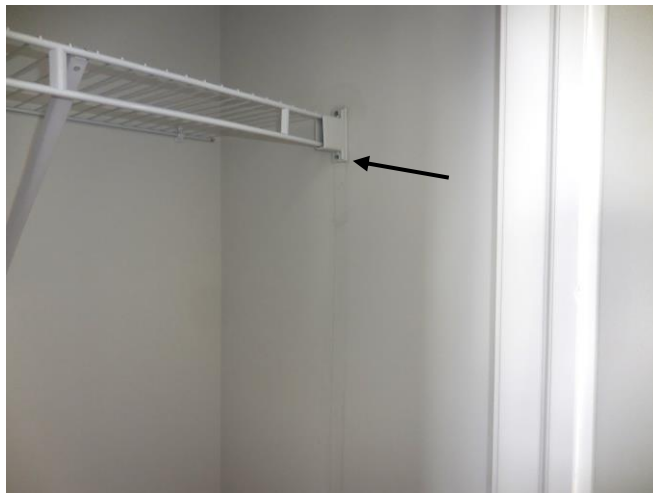
Water poured out from behind this shelf cleat in the main level closet when the 2 nd floor fixtures were operated.